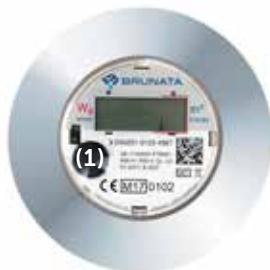
(1) touch sensor